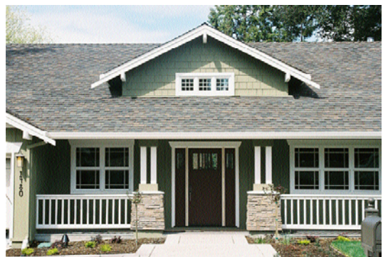
3,800 Sq. Ft. Custom Home in Alamo CA.

Stirling Architects believes strongly in listening closely to its clients to help them achieve their visions. It applies imagination and creativity in tailoring every project to the specific needs of each client the firm is serving. The company's logo represents its commitment to both going above and beyond and thinking outside the box through all phases of our clients' projects.