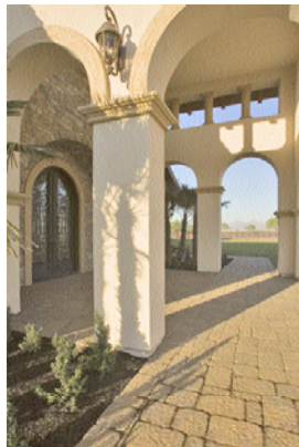
Valley Oak Arabians Bam Brentwood CA.

The firm is known for servicing the "Heck" out of its clients by communicating openly, maintaining realistic budgeting, and providing efficient planning, thoughtful contextual design and precise detailing. This focus on service above and beyond the actual design-and-drafting tasks has led to a significant amount of repeat business and referrals.