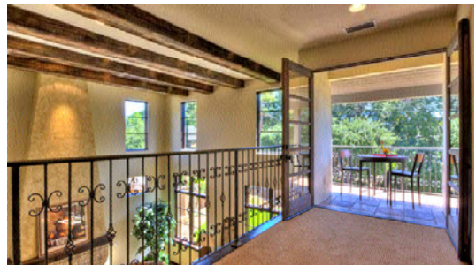
4,700 Sq. Ft. Custom House in San Jose, CA